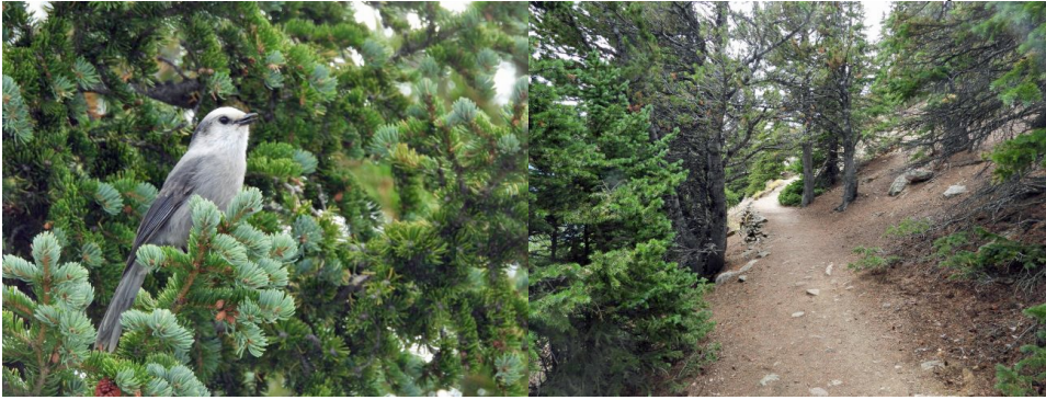
Canada Jay, then landed on my hand to eat nuts and raisins and store them

Scenes from the 27 September 2025 aspen-color viewing trip into Colorado's mountains for international students and families at Colorado School of Mines, Golden. Lead by First Baptist Church of Golden.