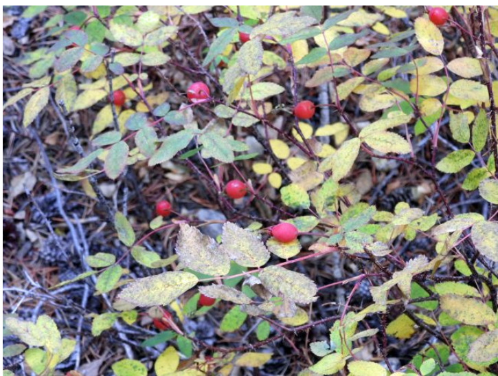
Small but edible and nutritious fruit of wild rose