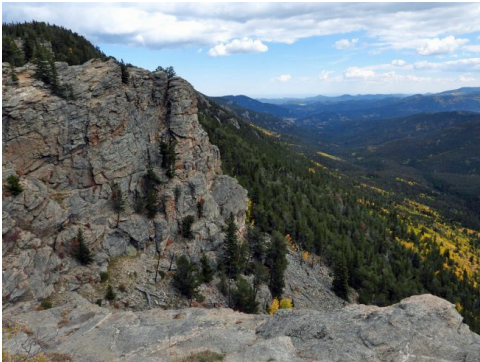
Start of overlook panorama