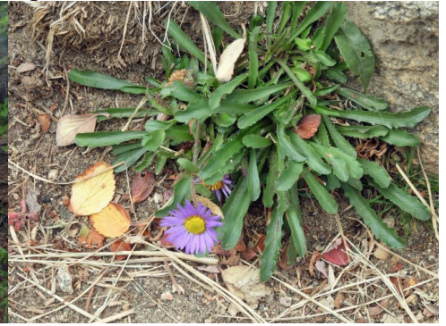
Flower at overlook