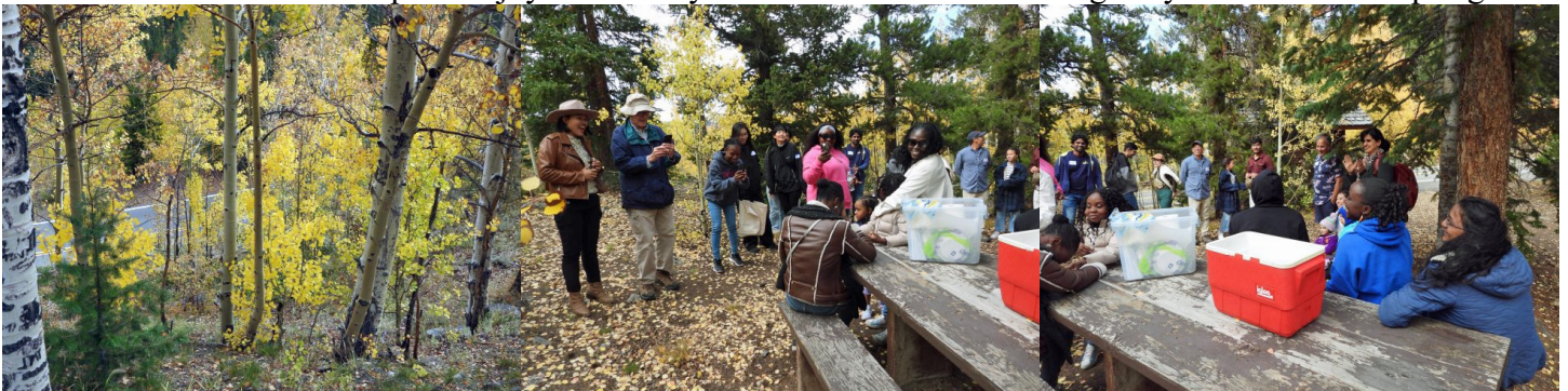
Aspen and conifer trees, third stop

Those were our first two stops to enjoy the scenery. Then we went down the highway towards Idaho Springs.