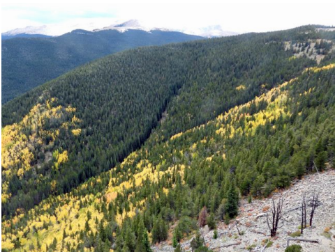
End of overlook panorama