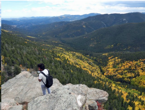
Student from India enjoying view