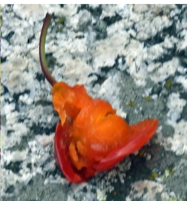
Opened rose fruit with seeds exposed. Rich in vitamin C. Used as syrup, jam, soup, tea. Commercially available as Rose Hips.