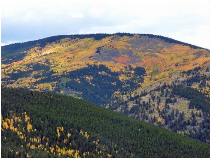
Distant mountain slope viewed from third stop