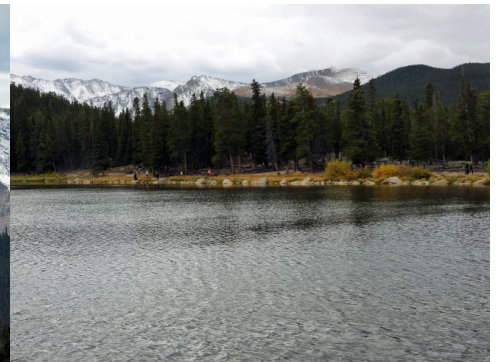
Same peaks beyond Echo Lake

Those were our first two stops to enjoy the scenery. Then we went down the highway towards Idaho Springs.