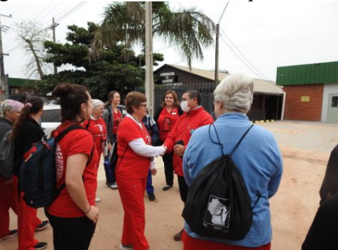
The governor (masked) greeted us.

For four days the Clinic was held in the village of Choferes, a little southwest of Loma Plata. We were in a building beside the Infant Maternity Hospital. Our arrival was a significant media event with the governor of the state of Boqueron.