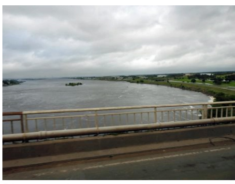
River crossing near Asuncion

The elevation rose from about 60 to 120 meters above sea level during the trip across this low flat land. The shales below the surface are very salty, so the ocean likely covered this area in the past.