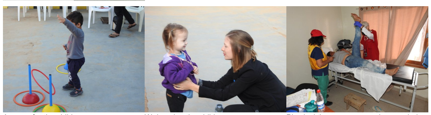
A game for the children