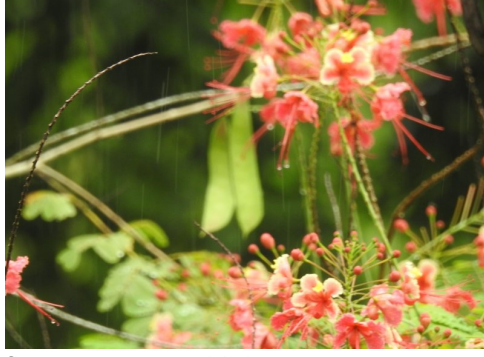
flowers to attract birds