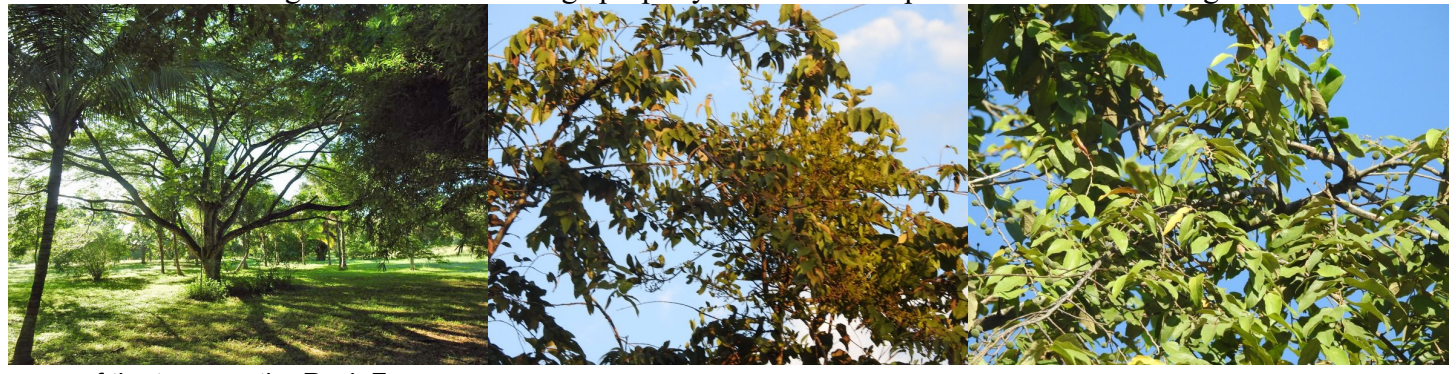
some of the trees on the Rock Farm

Mornings and evenings the trees and air are filled with many dozens of noisy White-fronted Parrots. In our late afternoon and morning walks within the large property I recorded 16 species of birds not being rehabilitated.