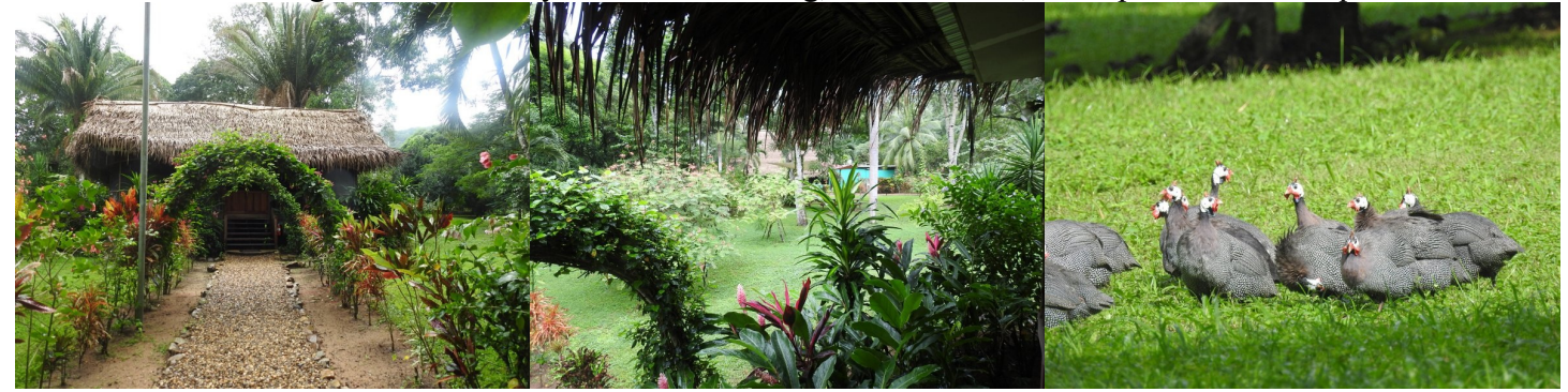
We had the right side of this cabin

at the time. The dining hall was near by. The next morning, 12 December, we explored the headquarters area.