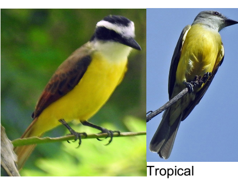
Social Flycatcher Kingbird