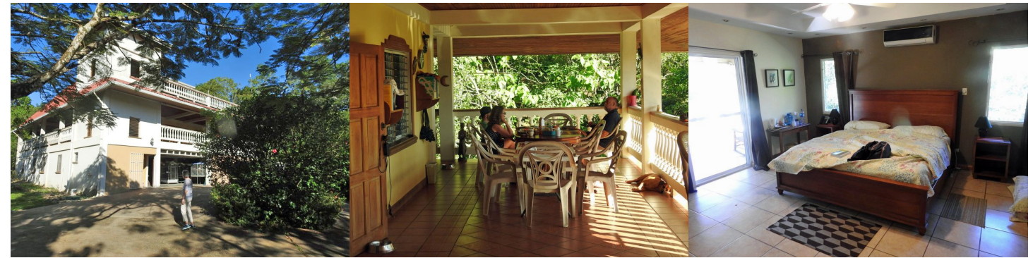
Belize Bird Rescue / Rock Farm