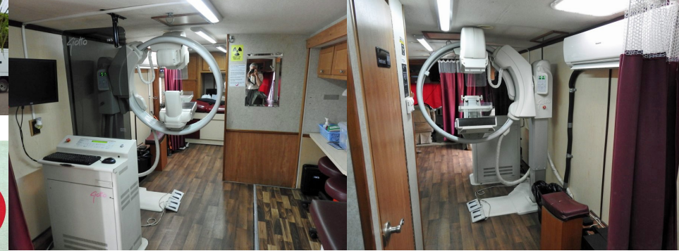
and provided mammograms, EKG, and other special health services.