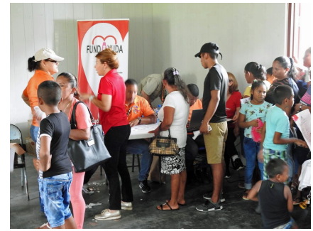
FundAyuda doing check-in