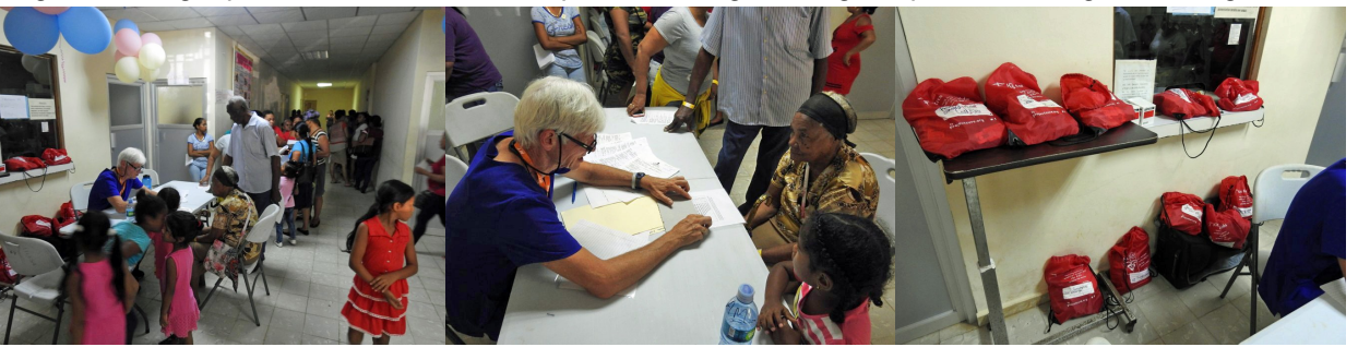
Crowd, Clyde at glasses, and supplies, sorted by strength