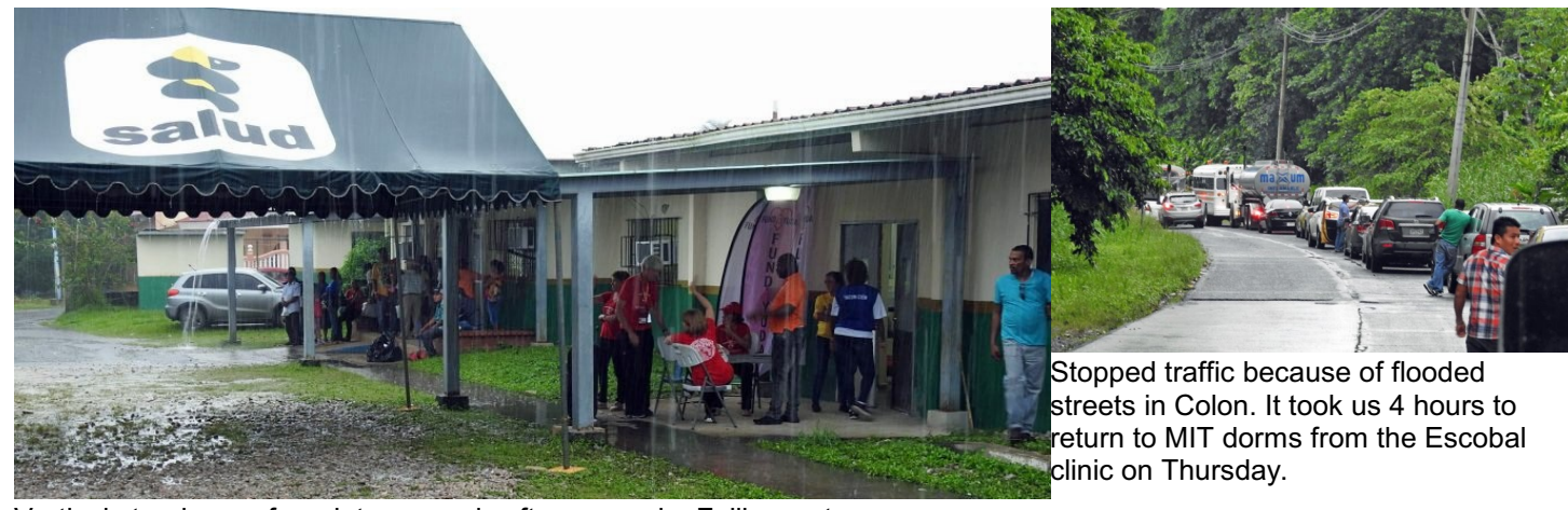
Vertical streaks are from intense early afternoon rain. Falling water near car.