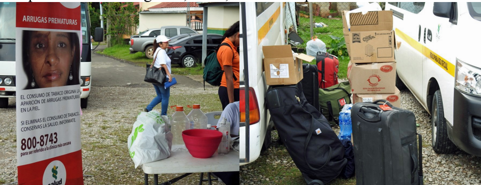
tobacco use ages the face prematurely supplies waiting for room assignment