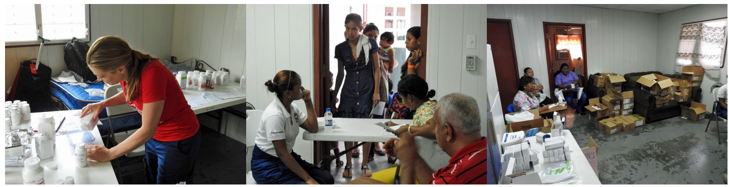
Amethyst at pharmacy