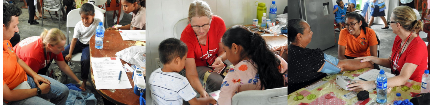
Meghan treating foot wound at triage