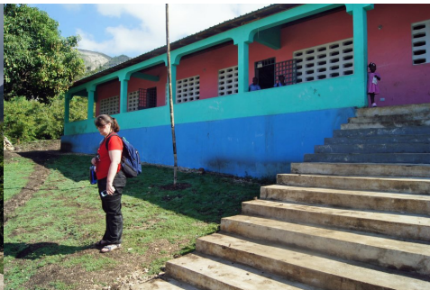
to North: northwest end of rooms