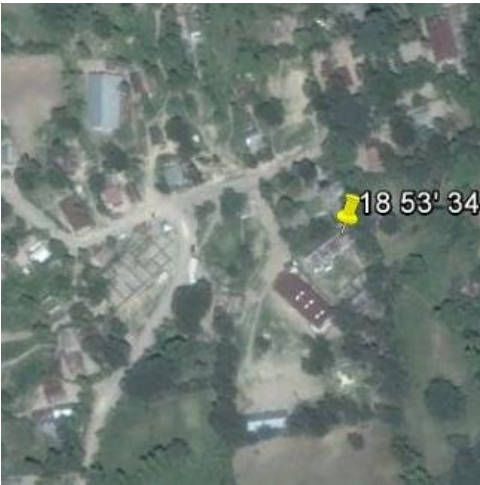
satellite view of Roy Sec