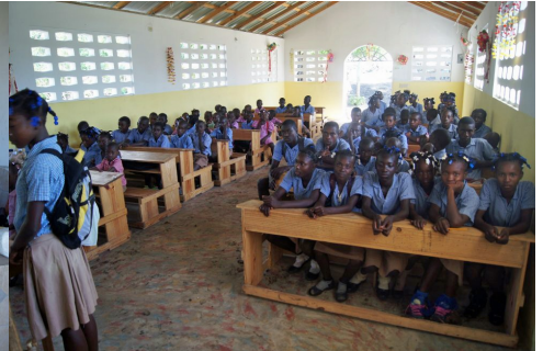
students in chapel. Notice uniforms.

All furniture looked locally-made, with long benches for students, a table and chair for teachers, and small chairs and low tables for the youngest children.