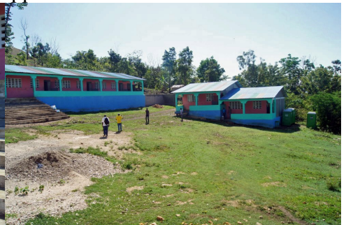
to East: most of classrooms