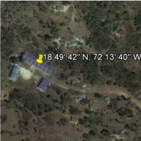
satellite view of Nordette