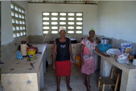
cooks in kitchen