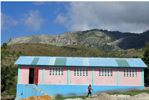
to West: chapel/dining-hall/kitchen

The third and fourth clinics were held on 27 and 28 April, west of Mirebalais, northwest of Saut d'Eau, at a community unofficially called Nordette. The end of the road to there was impassibly muddy. We had to walk the final 475 meters with our supplies. Satellite view: 200 m wide.