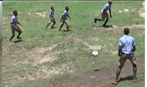
football (soccer) at Nordette, from video