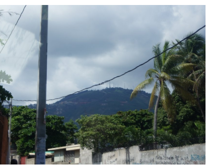
View of hilltop Observatoire