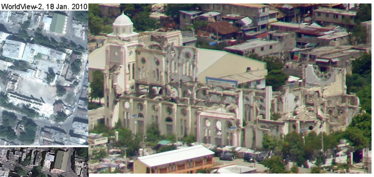
Iy photo, from Observatoire, of the Notre Dame de l'Assomption cathedral

Our 22 to 30 April 2017 trip to Haiti was organized by Project C.U.R.E. (www.projectcure.org) as a CURE Clinic to supply limited medical care to needy people