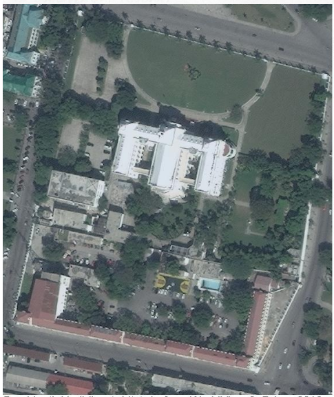
Presidential building (white): before, WorldView-2, 7 Jan. 2010.

Having studied daily satellite photos of activities at the airport after the earthquake, I was familiar with its layout in advance of our arrival there. On this trip I even photographed two junk aircraft at the east end that I knew might still be there.