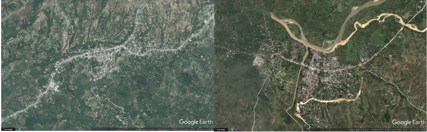
Buildings (white) near Belladere are mostly view.

visited the real Haiti. (see www.edholroyd.info/TripReports/2016%20Caribbean/CaribCruiseHaiti.pdf)