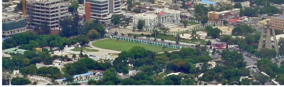
My photo of 29 April 2017. The National Palace ruins were removed from the left side during the Summer of 2012.