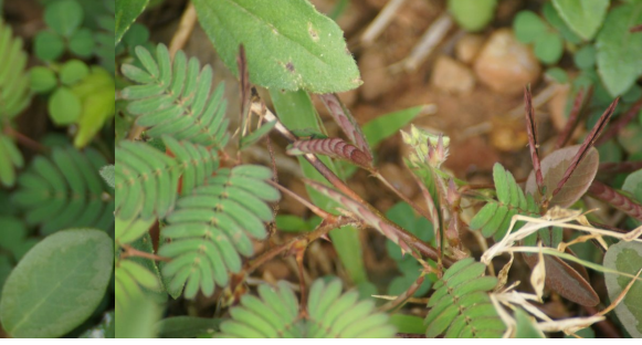
brown folded leaves after touch

The next scenes are from Adrobaa on Monday.