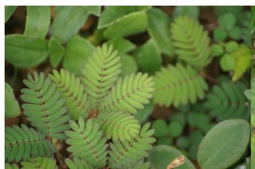
sensitive fern leaves before touch