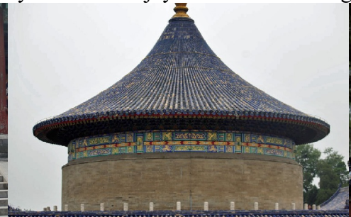
The central temple with the altar to Shang Di, the original God of China.