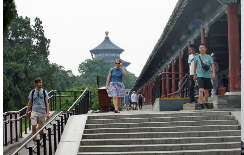
The path to the main temple building.

The afternoon was spent in the Temple of Heaven park. I did not visit inside main temple buildings this time, but I took photos to show that I was nearby. Instead I enjoyed the area as a large park and counted birds.