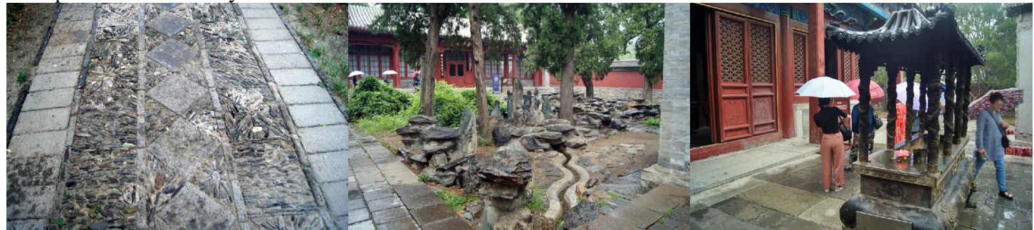
Pebble artwork in pathway.

Thursday morning had cool rain when we went to the northwest to the Fragrant Hills Park at the edge of the foothills. So we had the park nearly to ourselves. There was a long complex of Buddhist temples and other buildings and more than 800 years of history. In 1860 and 1900 the site was burned by European troops. One building is now dedicated to the memory of Sun Yat-sen, the first president of the Republic of China. Mao had a headquarters here in early 1949.