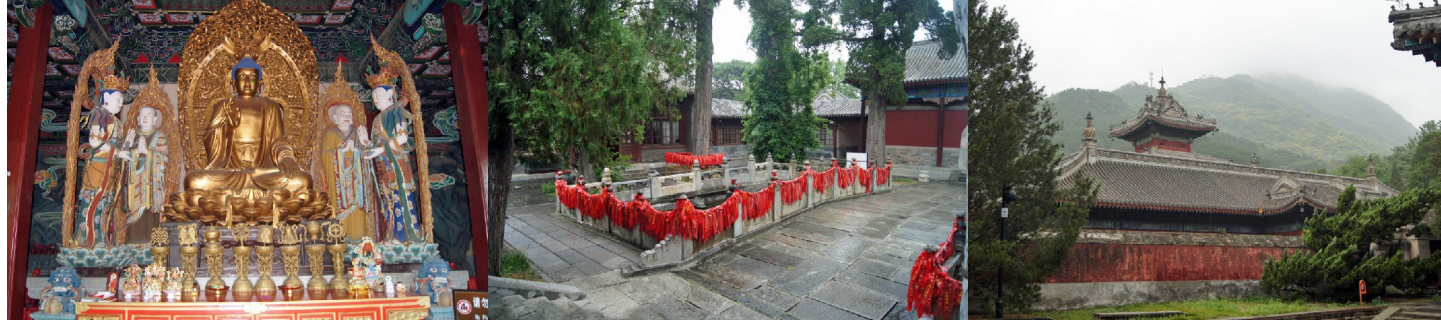
Buddhist altar inside a building.