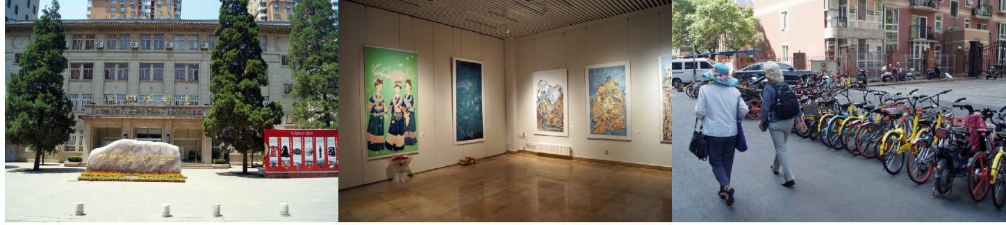
The Museum of Ethnic Cultures

For our first week we stayed at the Youth Holiday Hotel on the west side of the Minzu University campus. The attached Good Restaurant provided all meals in buffet style, allowing a quick selection from a large variety of foods. The Minzu University is designed especially for students from the 55 official minority people groups of China. (The Han people group is the huge majority of the rest of the population.) There is an excellent museum on campus with cultural exhibits from many of those people groups, but photography was not allowed. We also visited an excellent art exhibit showing works by graduating students. During the end of our second week our world view lectures were held in one of the campus buildings.