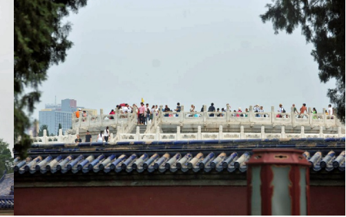
Looking over the wall to the large altar on the southern end of the complex.