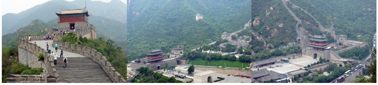
I reached this eastern summit tower.