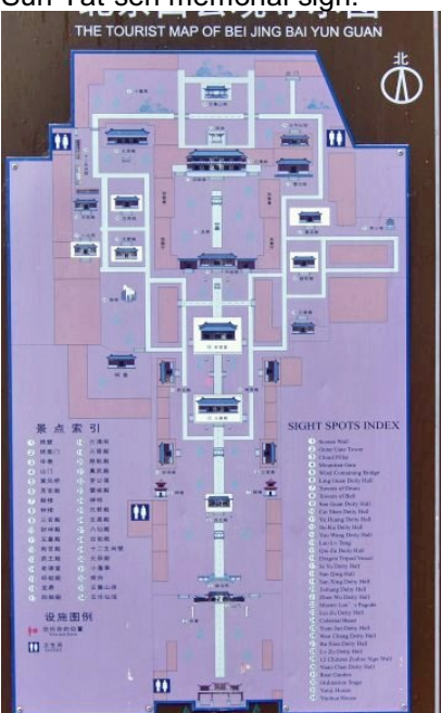
Beijing Bai Yun Guan is honored as the chief temple of the Three Ancestral Temples of the Quan Zhen (Complete Reality) Taoist tradition. Originally called Tian Chang Guan (Temple of Eternal Heaven), it was built in 741 A.D. under Emperor Xuanzong of the Tang Dynasty. In the Song Dynasty it was renamed Tai Ji Gong. At the beginning of the Yuan Dynasty, Master Qiu Chang Chun was appointed to this temple by Emperor Genghis Khan to preside over Taoism in China, upon which it was renamed Chang Chun Gong (Temple of Eternal Spring). After Qiu Chang Chun's ascension to heaven. Chu Shun Tang was built to enshrine his physical remains, a hall located east of Chang Chun Gong. In the early Ming Dynasty, the temple was ruined by war, only Chu Shun Tang remained to become the centre of rebuilding, the temple was then renamed Bai Yun Guan. Since the founding of the People's Republic of China, the temple has undergone three extensive renovations with support from the Chinese government and so the traditional magnificence of this time-honored temple has been revitalized. At present the temple buildings cover an area of approximately 10,000 square meters, including nineteen deity halls carefully aligned along three north-south axes. With a rear garden, the overall area of the temple is about 60,000 square meters.

angined along inree north-south axes, with a rear garden, the overall area of the temple is about 60,000 square meters. Listed as a historic site under the protection of the Chinese government in 2001, thouses the offices of the Chinese Taoist Association, the Institute of Chinese Taoist Culture, the Chinese and the Editorial Department