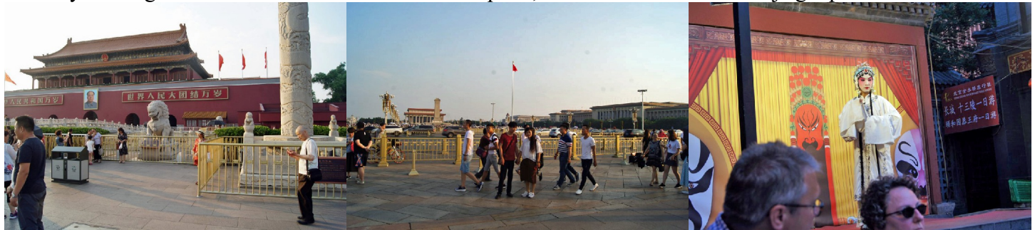
South entrance to Forbidden City

Tuesday evening we had a brief visit to Tiananmen Square, with dinner at a small Beijing Opera theater.