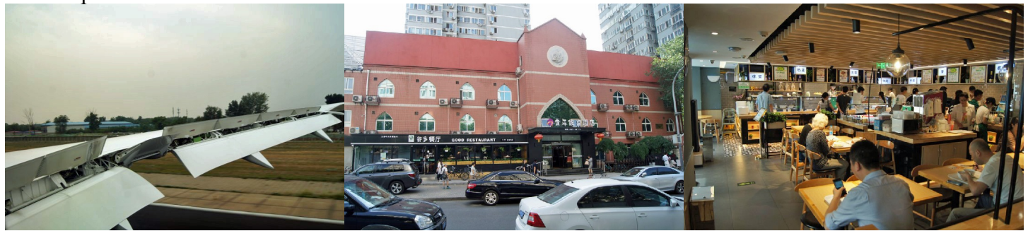
Landing in Beijing, 787 aircraft

I returned to China, landing on Sunday, 18 June. This time I am with a different group, ERRC (www.errchina.com), which has been offering programs in China for more than thirty years like ELIC. My six weeks here is in two parts. First is the Chinese World Views course given by ERRC during the remainder of June. During the four weeks of July I will be teaching an undergraduate science course at Peking University, one of the top two universities in China.