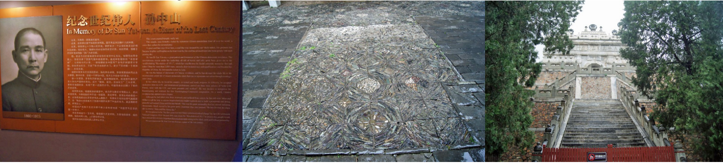
Sun Yat-sen memorial sign.