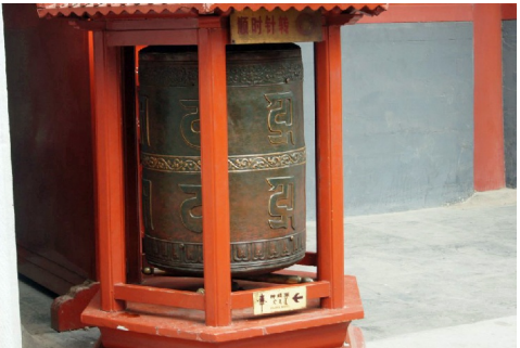
Pathway for Tibetan Buddhist Temples. The second column from left is Tibetan. Prayer wheel.