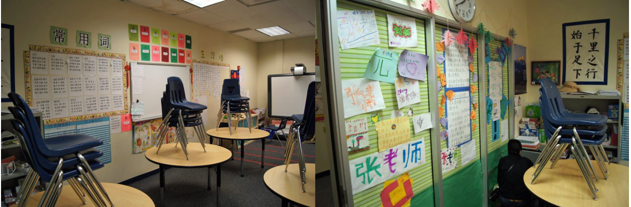
The Chinese side of Qunling's classroom.