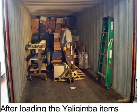
The remainder of Boteka boxes