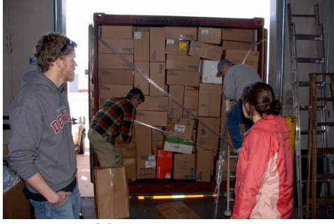
Example of fully loaded container

Late Saturday afternoon we went to the annual International Day activities of Colorado School of Mines, Golden, Colorado. There are 750 students from other countries there. Many of them provided sample foods representative of their countries. In the evening many of them presented talent and fashion shows for the audience. The first two photos show some food booths before crowds came.