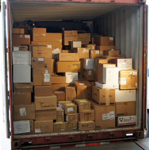
All ready to go to Congo