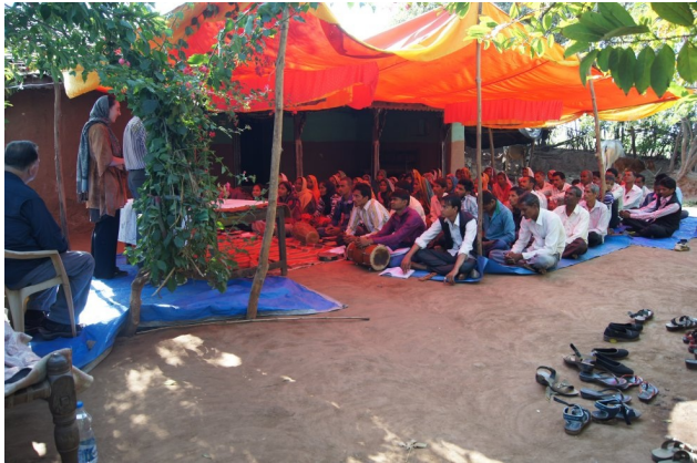
Cattle were beside this home in the hills.