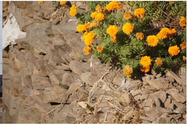
We were often greeted with necklaces of these marigold flowers, as below.