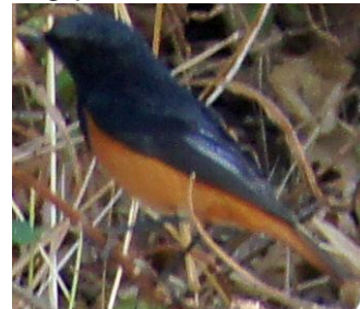
Black Redstart, also in China.