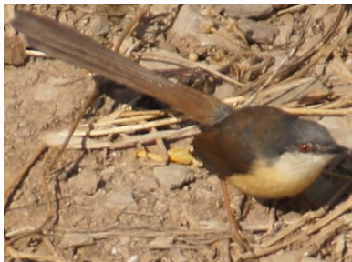
This Ashy Prinia wagged its tail to flush out insects.