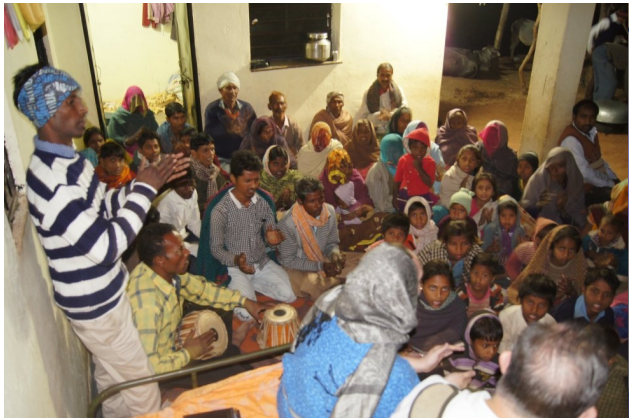
An evening meeting at a rural home.