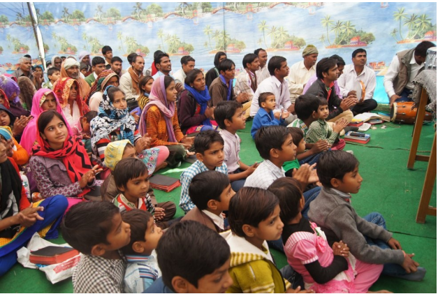
A farming community gathered under a canopy at a home's front yard.