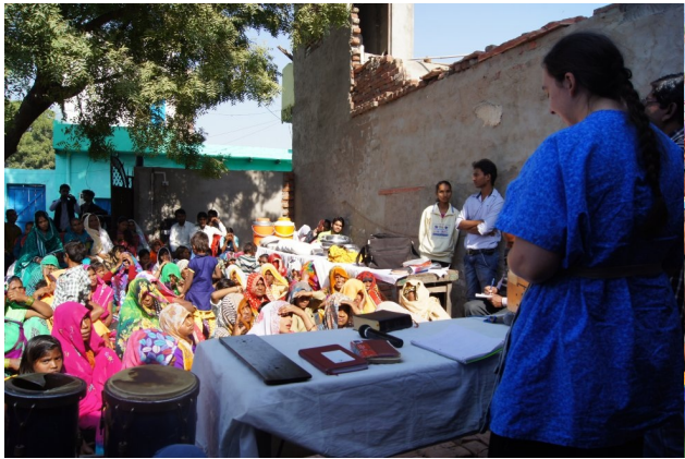
At a city home neighbors listened from the adjacent roofs and street.