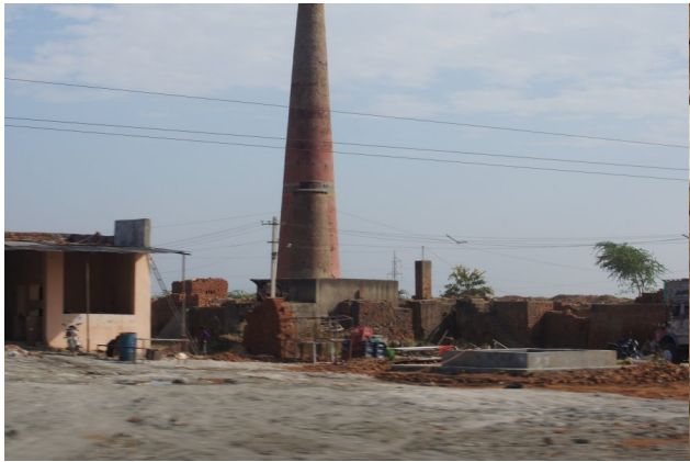
There were many brick factories in the area.