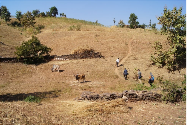
We walked about a kilometer to get there.