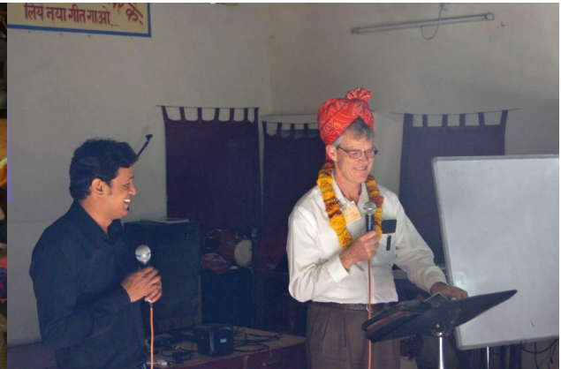
The special hat was given to us only at our first meeting place.