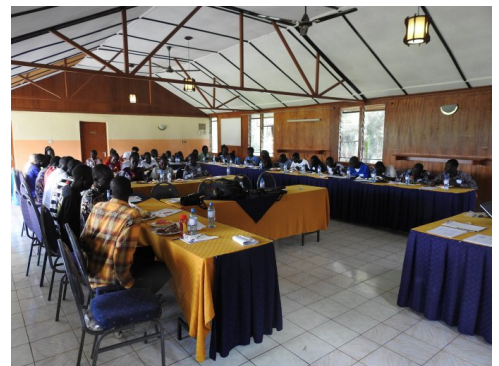
High school group at special lunch.

We split the students at Home Base into elementary and high school groups and had them served a special lunch at Rift