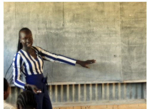
English lesson being taught by an Seeds graduate with well-used chalk board

There seems to be an impression that the quality of education offered in the refugee camps is poor. Perhaps it is difficult to attract good teachers to work in this environment. We met one Seeds high school graduate who decided to return to Kakuma with her new knowledge and skills to improve the teaching there. She taught her lesson well.