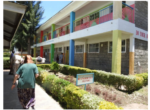
A classroom building. Encouragement signs and slogans are everywhere.

All eighth grade students need to take the Kenya