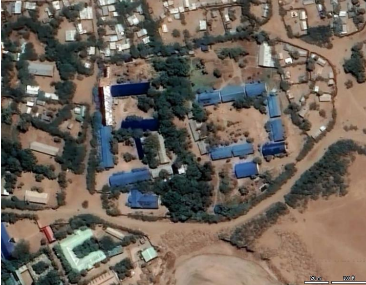
Satellite view of the Kakuma school campus used by refugees from South Sudan. Tan areas are dirt. Blue roofs are new buildings; gray roofs are older classrooms.

Education in the Kakuma refugee camp for students not in the Seeds program.