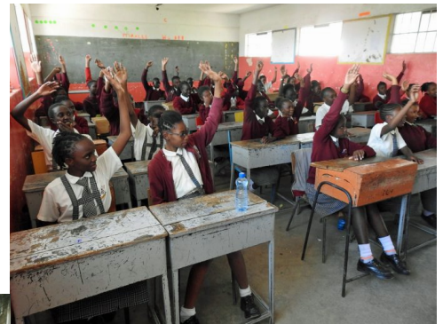
A classroom scene at Roots Academy.