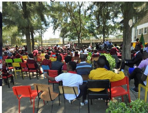
Some of the thousand students at the graduation ceremony.

An Seeds Home Base leader proudly shows off the student-chosen list. For the past six years the presidents were Seeds students, not Kenyan.