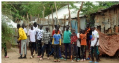
South Sudanese children waiting for sponsorship into the Seeds program

The South Sudanese elders (right) select the children for the Seeds program if and when financial sponsors are found.