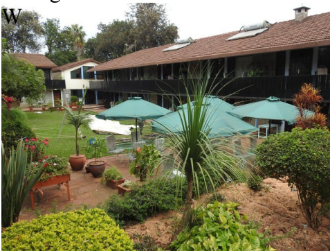
Africa Heart Lodge in Nairobi.