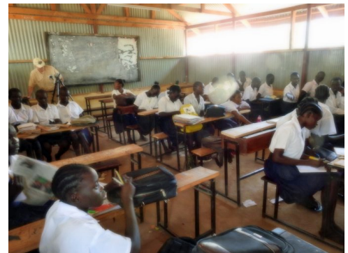
Classroom for English lesson

There are several schools scattered around the different sections of the Kakuma refugee camp area. This is camp area 1.