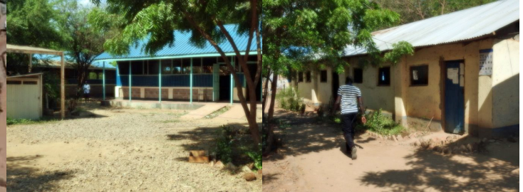
New school building