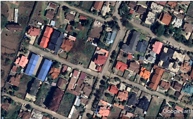
Satellite view of Home Base, center, green lot to left.

Living conditions at Home Base are crowded when the students are there during Spring break. There is a large vacant lot adjacent that could be useful for expansion, gardening, and game area, but there is no indication that the lot could ever be for sale.