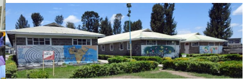
Decorated boys dormitory buildings.