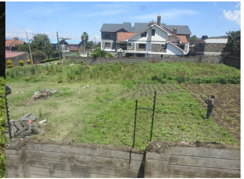
View from Home Base second floor.