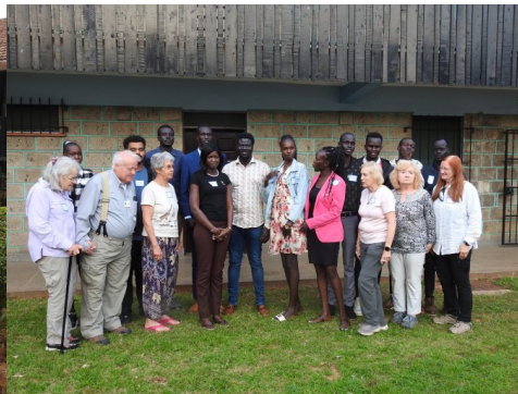
Seeds college students and our team.