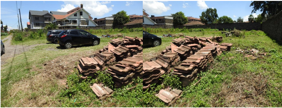
Photos of the adjacent vacant lot.