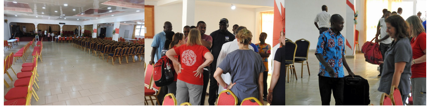
Seating for those waiting for exams Initial gathering for planning

The first and second clinics were held in a church building. As we arrived the local people under the tents stood and applauded. The interior was spacious and comfortable with no direct heating from the sun.