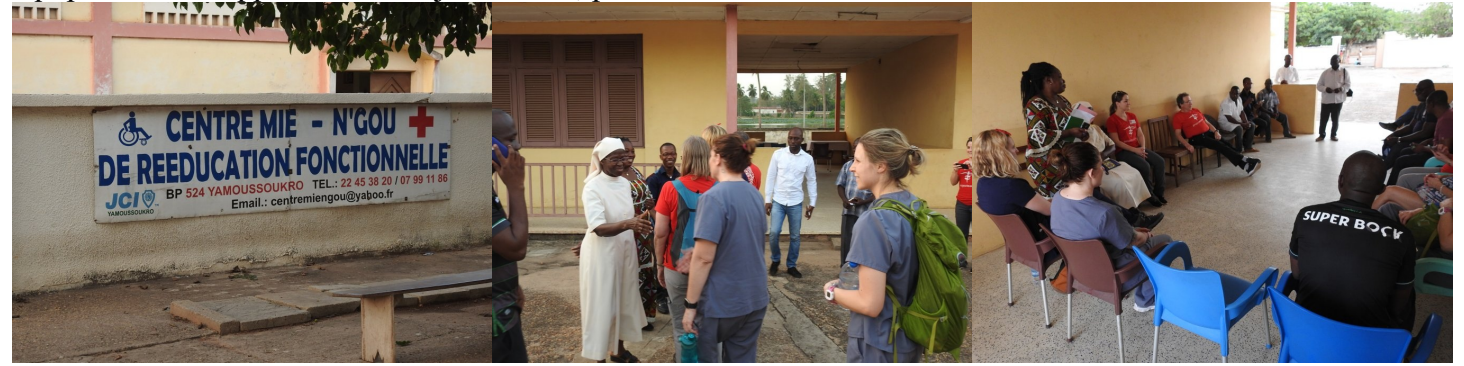
We were warmly welcomed.

As Monday evening approached we went to a lakeside rehabilitation facility that had received a shipment of equipment and supplies from Project CURE, part of the contents of a 40-foot container.