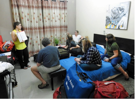
Team planning meeting

Monday morning we loaded the van again and departed on the drive of several hours to reach our first clinic location, in the capital city of Yamoussoukro. The good major highway made the trip pleasant.