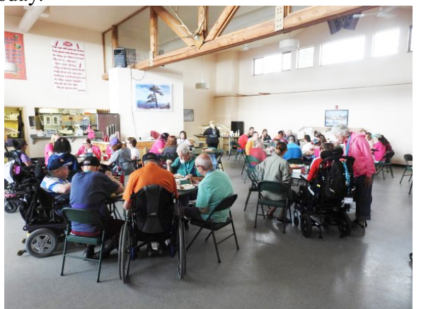
Campers and volunteers eating together.

Golden Mantled Squirrels at left, rabbit at right]