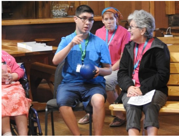
Bingo game inside Buckhorn Lodge

Monday evening we were in a large circle, passing a blue ball. When the music stopped, as in musical chairs, the person with the ball had the opportunity to give thanks for something.