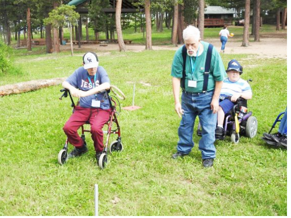
The tossed ring is near the left person's elbow