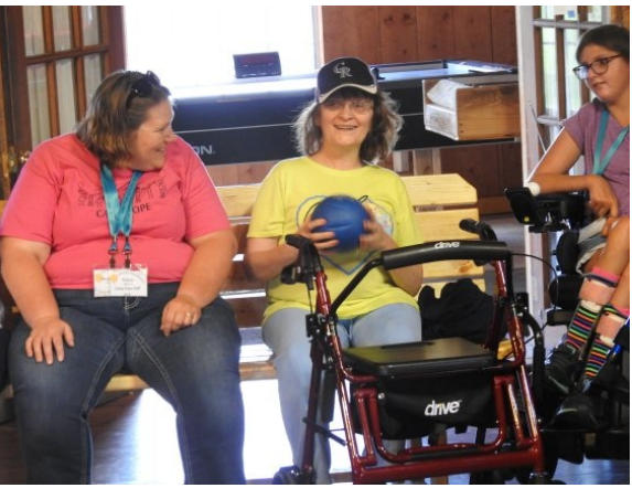
Giving thanks joyfully