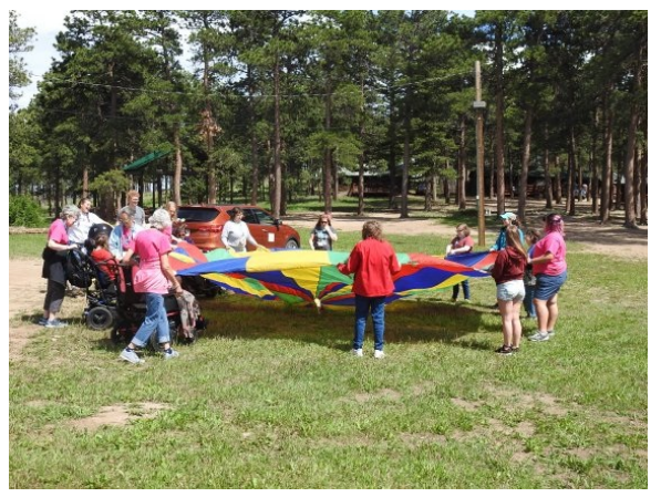
Bouncing balls with a colorful parachute