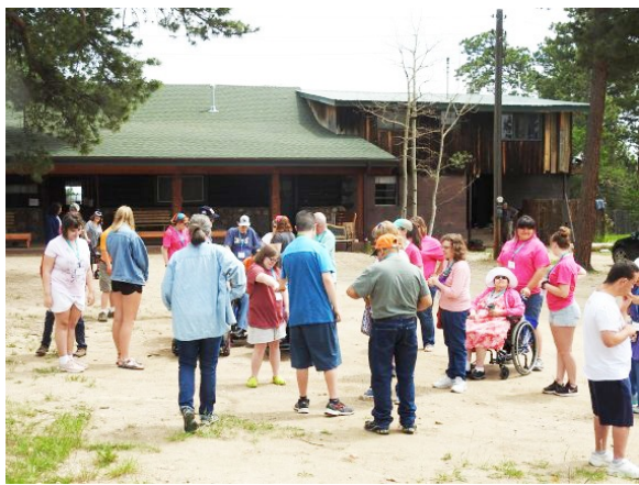
Campers and staff at Buckhorn Lodge

During our meals we volunteers served the campers by bringing the food and utensils to the tables. Though most campers were mobile, notice the several wheel chairs. We also took the dishes and utensils to the dish room after the campers and ourselves were finished eating. Almost everyone could feed themselves, though some needed help.