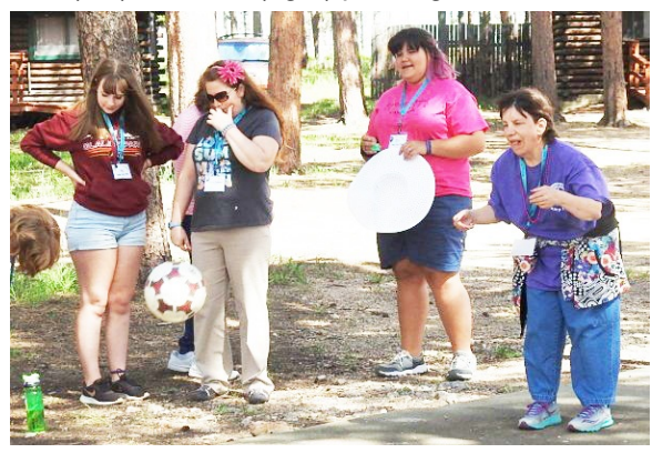
Throwing a ball at ten bowling pins