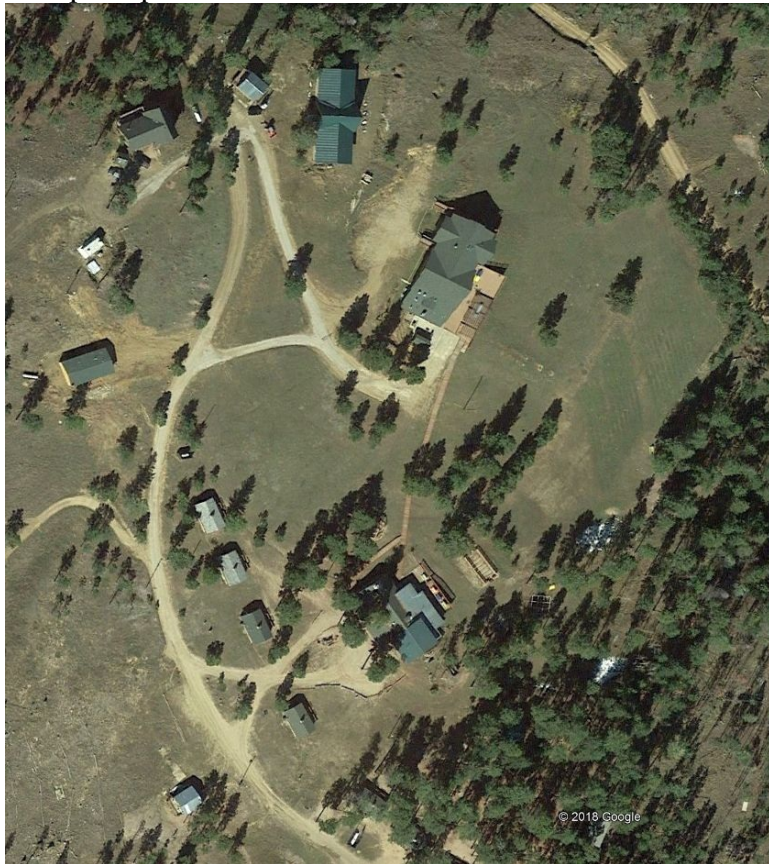
Google Earth satellite view of Buckhorn Camp from 2017.

There are no nearby villages up there. Apart from isolated homes and farms, the main nearby feature is a peak loaded with perhaps a dozen radio towers.