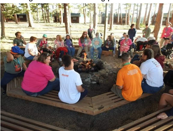
Evening campfire with singing