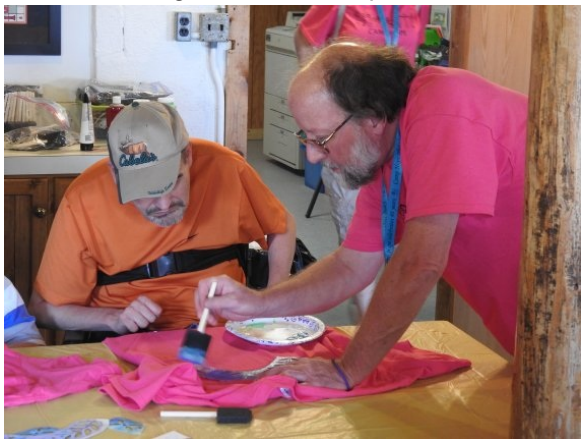
Helping with shirt painting