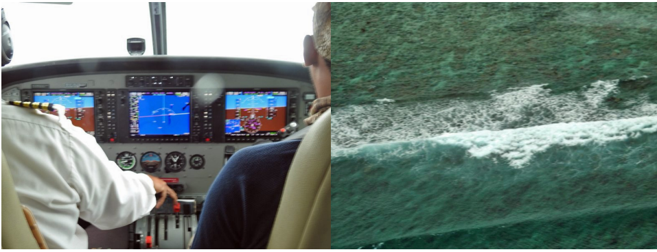
a view of a modern instrument panel