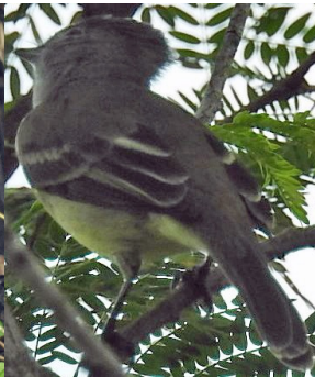
Great Crested Flycatcher