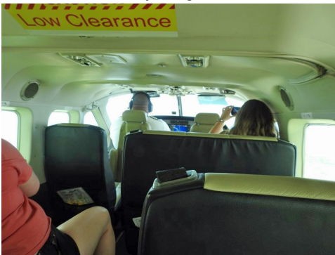
the pilot and the other two passengers

We arrived at the BZE airport at about noon for our expected 2:40 PM flight to San Pedro. We returned our Jeep to Crystal Auto Rental and checked in with Maya Island Air. The main aircraft type for them and for Tropic Air are single-engine turboprop Cessnas holding about 12 passengers. Both airlines have hourly flights with variable passenger loads. They decided to put us on the flight one hour earlier. It carried one pilot and 4 passengers including ourselves.