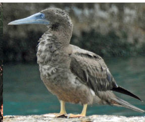
young Brown Booby