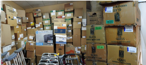
room full of blue