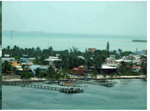
approaching Caye Caulker