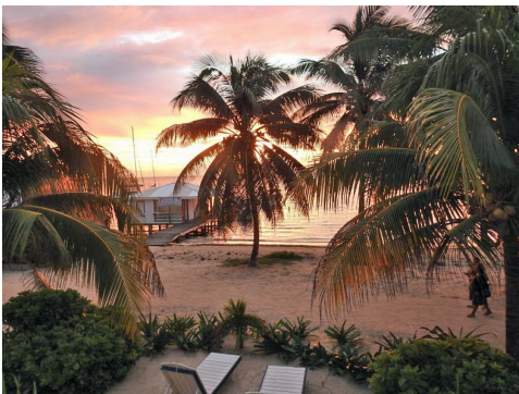
sunrise from our hotel balcony

The main reason for our visit to San Pedro was to enjoy the barrier reef environment. Twelve years ago we stayed at Caye Caulker (less expensive than San Pedro and less crowded) and snorkeled the reef between those two locations. We thought we would try the more popular tourist spot this time. As it turned out, our snorkeling at Placencia showed us that at our age we had limited endurance in the water. After the clinic visit, I spotted an idle boat with a glass bottom. We had experienced a glass-bottom boat reef visit in eastern Fiji in 1971 and thought it would be a good option at San Pedro rather than getting in the water there. However, the weather was getting stormier, with increasing wind and waves. The boat owners agreed with our suspicions that we should not use that boat that afternoon. So we relaxed at and outside our hotel room instead.