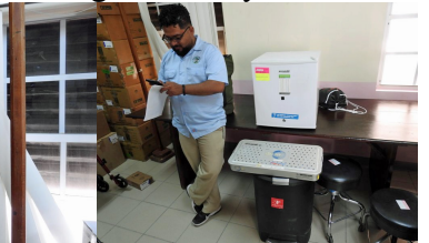
blue, with my marks government official

The government administrator had never seen the distribution instructions sent with the shipment, nor my back up instructions which he is holding in the photo to the right. He had been puzzled why the smaller Caye Caulker clinic had received the larger (orange) load and San Pedro the smaller (blue). My instruction sheet clarified what went wrong on the mainland where the load was separated. He then understood how to correct the distribution without moving everything. Items with the same Product Code numbers need not be moved except to satisfy the intended count of them. So my visit was very valuable to him, though he wasn't informed of our intended visit.