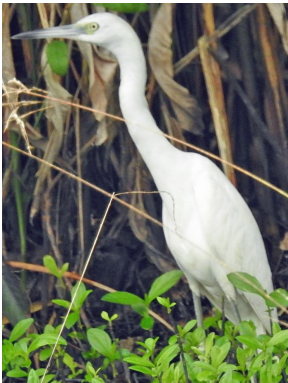
Little Blue Heron-young

After passing back through Belmopan we stopped again at the Cheers Restaurant for an early lunch. We walked around outside while waiting for its preparation and saw some additional birds.