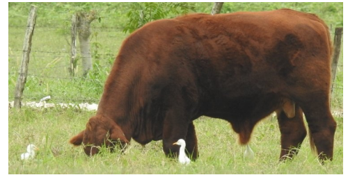
Bull and Cattle Egrets ready for flies

Belize - Part4 Tuesday morning, 17 December, was over cast with low clouds obscuring the tops of the local hills. The darker morning likely delayed the arrival of birds at breakfast time. We photographed birds along the long entrance road instead.