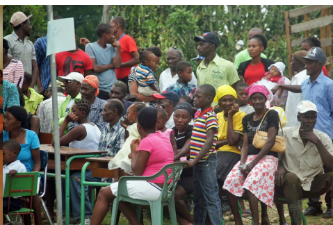
registration at first Belladere clinic