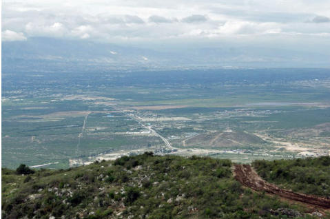
looking down at Port-au-Prince