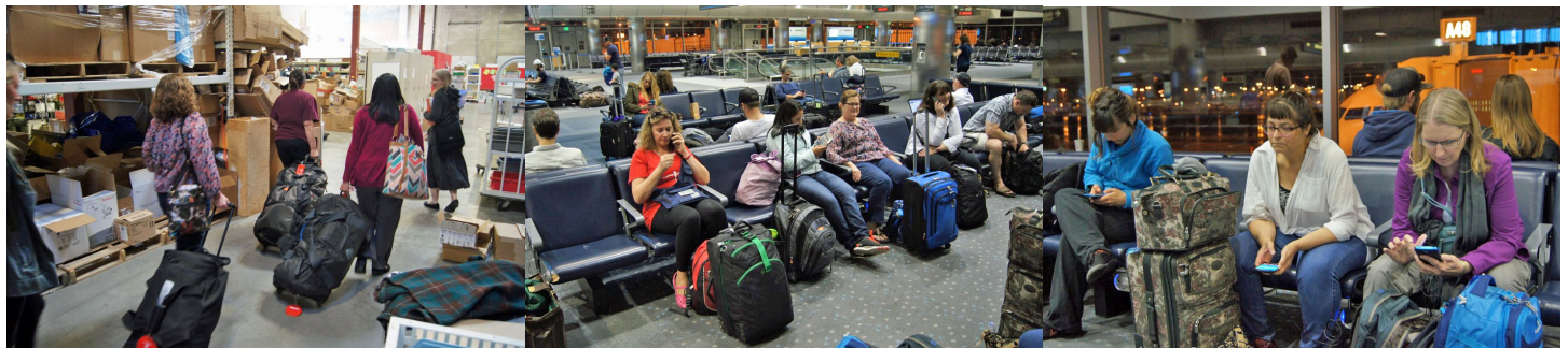
Leaving with supplies