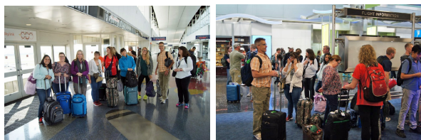
Early morning waiting at airport, 22 April Still waiting, with plane outside

We had plane changes in Dallas and Miami before reaching Port-au-Prince, Haiti.