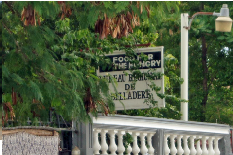
arrival at guest house in Belladere