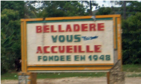
"Belladere welcomes you"