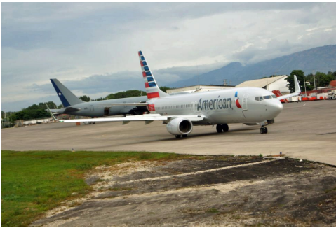
Same type of airliner at Haiti airport