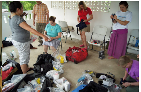
arranging the clinic supplies