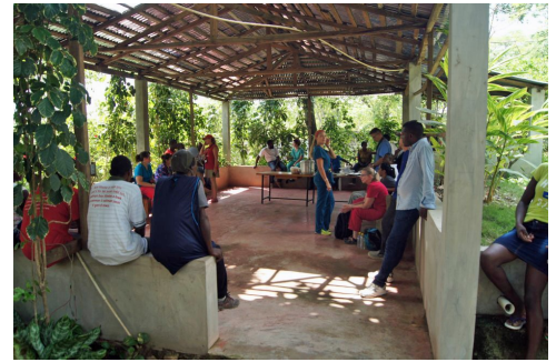
lunch spot away from the school

After the clinic we crossed the border to Dominican Republic for a brief visit.