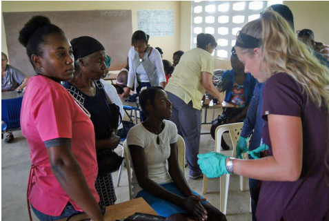
Bey with patients and local nurse