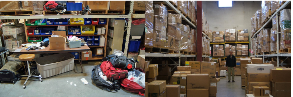
supplies and luggage bags