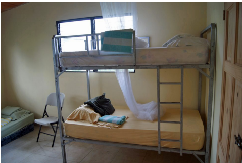
Men's bedroom. Note mosquito nets.