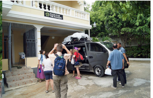
unloading van at guesthouse