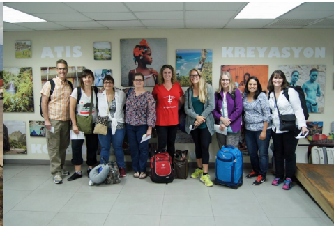
Inside airport terminal