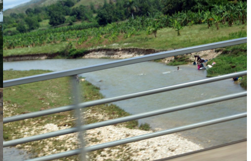
river laundromat, with rear banana trees