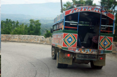
Haitian bus, with typical words of faith