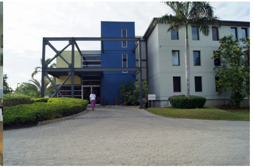
Servotel, built from shipping containers