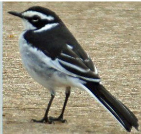
African Pied Wagtail