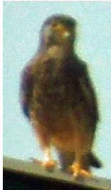
Eurasian Kestrel ->