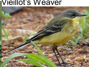
Western Yellow Wagtail