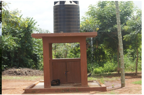
clean water source overflowing on right