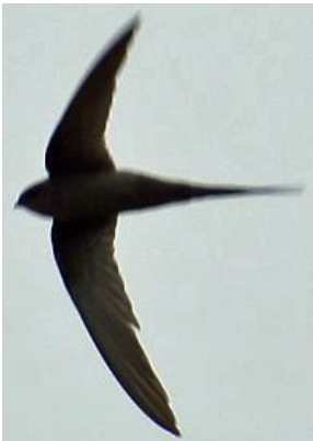
African Palm-Swift (very difficult to photograph)