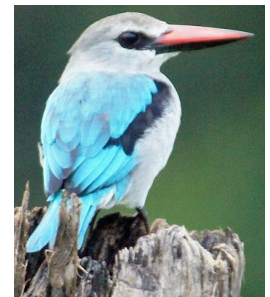
Woodland Kingfisher -