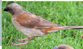
Northern Gray-headed Sparrow