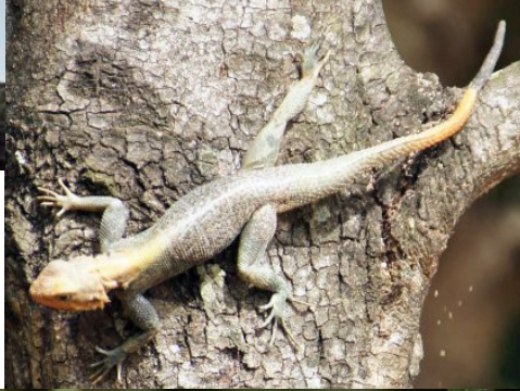
large lizard with orange head, tail: