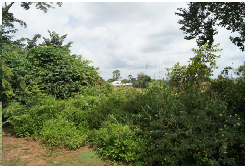
local vegetation, distant house