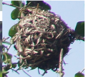
Village Weaver nest

These Weavers enter their nests from the bottom.