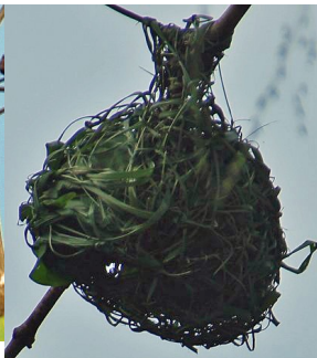
Vieillot's Weaver nest