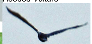
Long-tailed Cormorant (leaving)