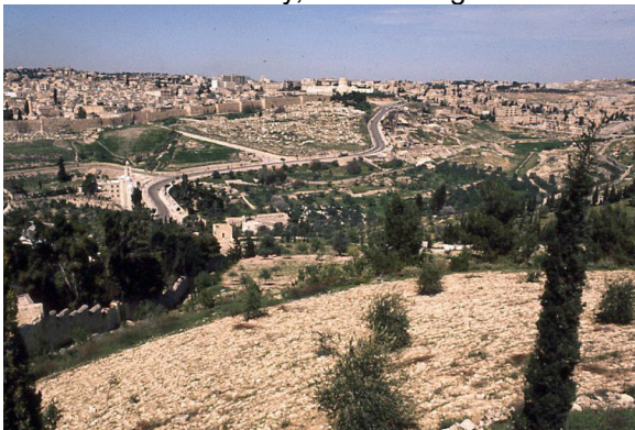
1970 route into Kidron valley

There are more trees in 2016 and taller buildings on the horizon. The building in which we stayed in 1970 is still there but covered by trees.