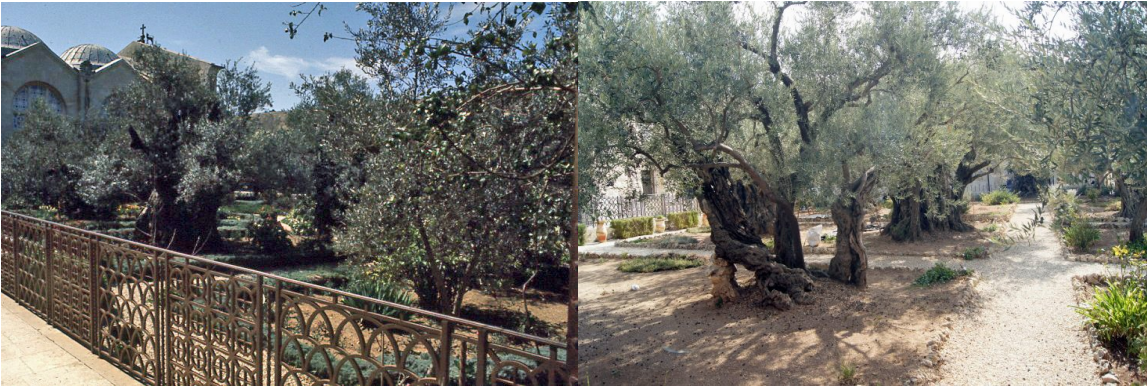
1970 Orthodox Garden of Gethsemane