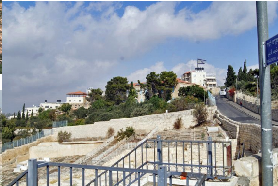
2016 same route down