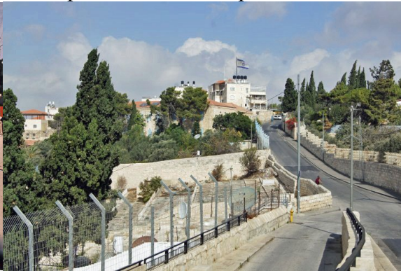
2016 The wall positions and road are the same.

There are more trees in 2016 and taller buildings on the horizon. The building in which we stayed in 1970 is still there but covered by trees.