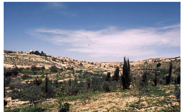
1970 near valley bottom, Garden of Gethsemane