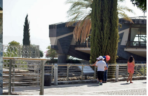
2016 Modern church above excavation