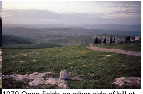
1970 Open fields on other side of hill at Nazareth. Now covered with many homes and roads.

We passed by the town of Cana, site of the miracle of Jesus for turning water into wine for a wedding. The new abundance of homes made it unrecognizable for me.