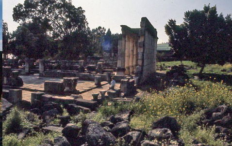
1970 Gail sitting at back of synagogue