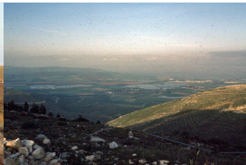
1970 White canopies on distant fields

In 2016 we saw numerous fields under canopies. We noticed such water-conserving strategies in 1970 as shown by the view from Mount Gilboa with white fields in the distance.