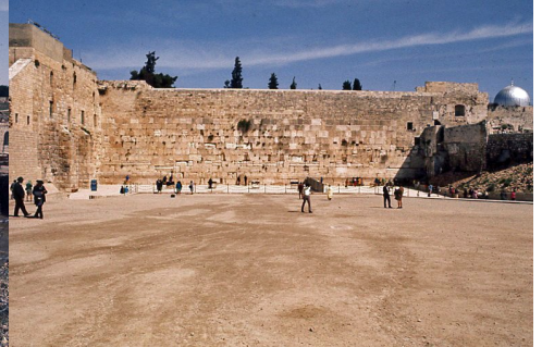
1970 Western Wall