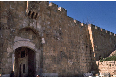
1970 Lions Gate