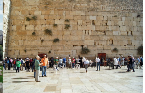
2016 Western Wall