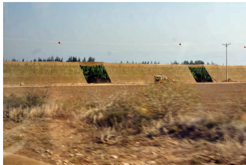
2016 Bananas under canopies