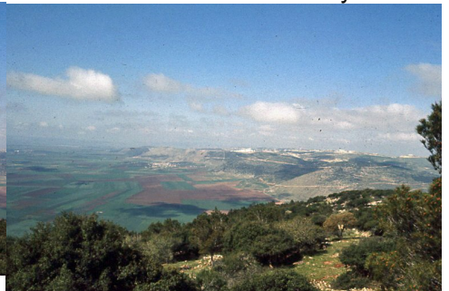
1970 Nazareth: white buildings on hilltop