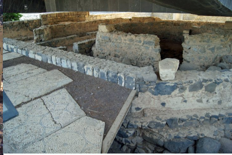
2016 Excavation complete