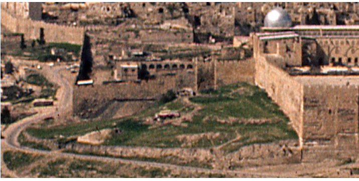
1970 Southeast corner, before excavation.