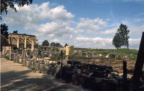
1970 Synagogue at left

The other large structure at Capernaum is the white synagogue built on the dark foundation of the original building of the time of Jesus.