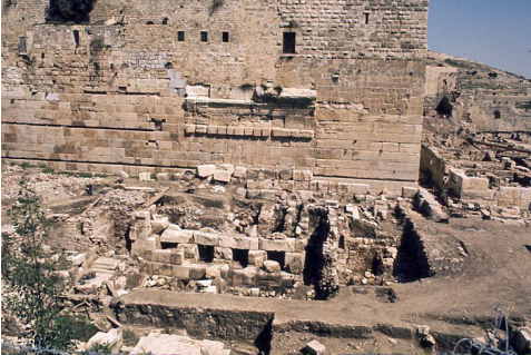
1970 remains of Robinson's arch

The Robinson's arch in the southwest corner was newly exposed when we were there in 1970.