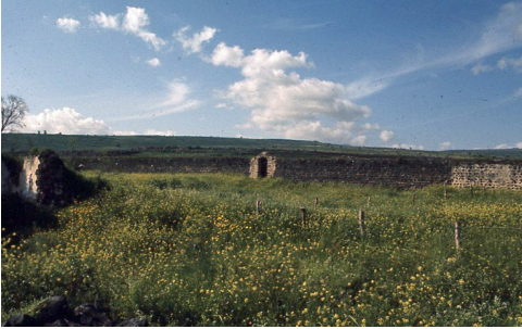
1970 North, of east side of Synagogue