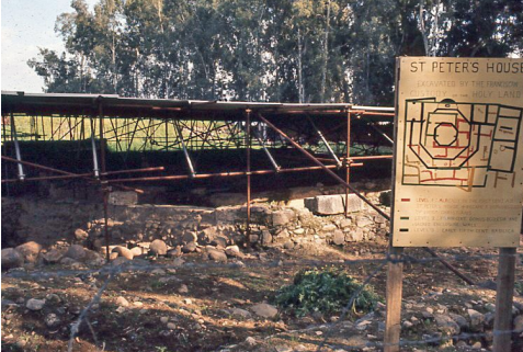
1970 Peter's house being excavated

Capernaum, the ministry home of Jesus, was in the initial stages of excavation and restoration in 1970.