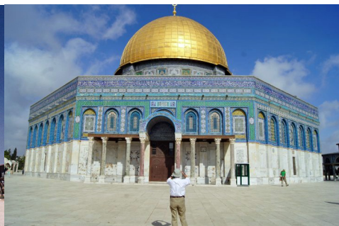
2016 Dome of the Rock