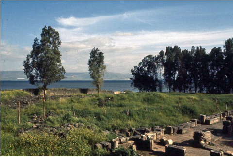
1970 South, from Synagogue to Lake