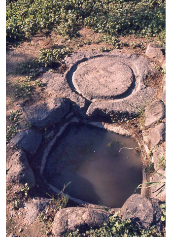
1970 Wine press?