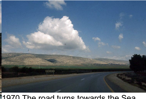
1970 The road turns towards the Sea (Lake) of Galilee. Same route in 2016.