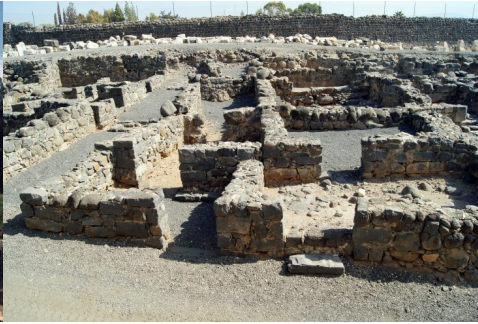
2016 Same area, looking east