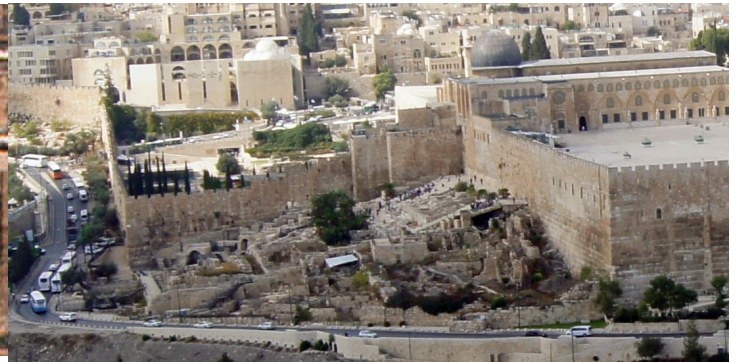
2016 Southeast corner, excavated, exposing steps

The Robinson's arch in the southwest corner was newly exposed when we were there in 1970.