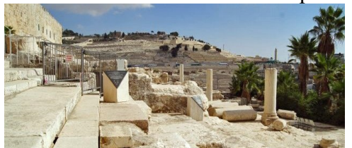
2016 reverse view, exposed steps

Of particular interest is the change in the southeastern corner of the Temple.