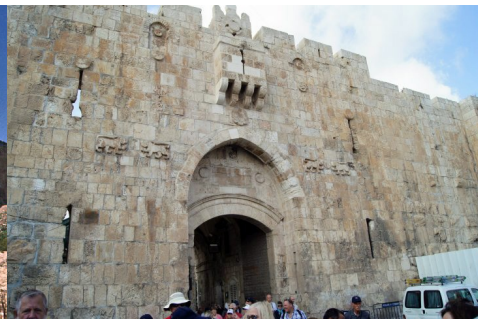
2016 Lions Gate

Apart from increased trees and lawn areas, I did not notice significant changes in the Muslim buildings on the Temple Mount.