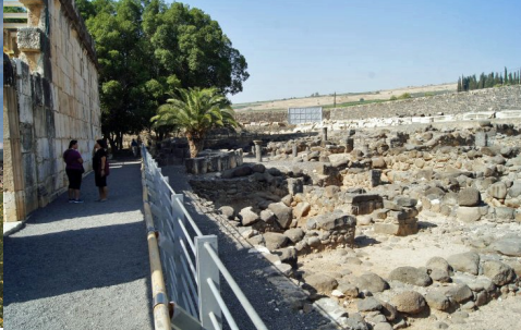
2016 North, of east side of Synagogue