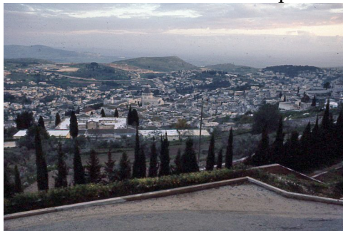
1970 Home of Jesus in center of view

The city of Nazareth is greatly enlarged from when we first visited there. In 2016 we simply passed through. There were no good places for overviews. In 1970 the oldest parts of the city were identifiable by olive-colored roofs.