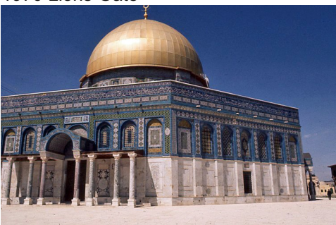
1970 Dome of the Rock