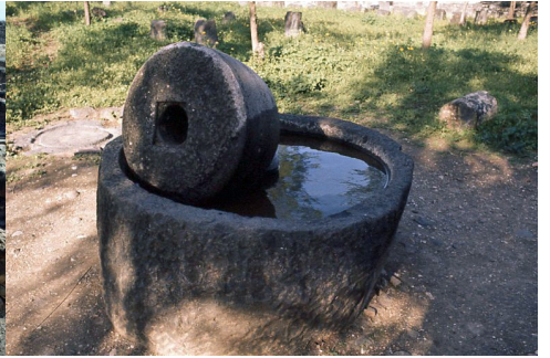
1970 Olive millstone not seen in 2016