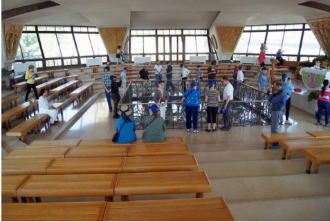
2016 Church centered around old home