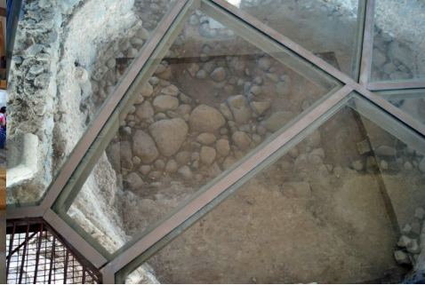
2016 View: stones of Peter's home