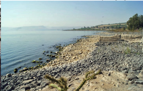
2016 Receded shoreline at Capernaum