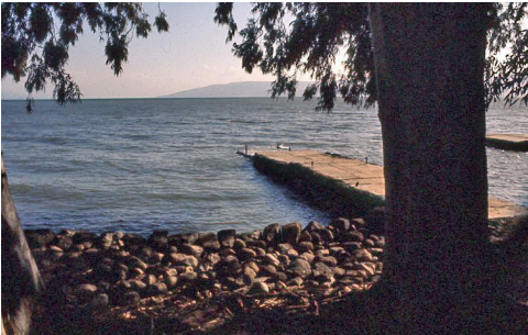
1970 Shoreline dock gone in 2016