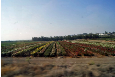
2016 Flowers growing in Jezreel Valley

As we traveled (in 2016) from Haifa to Capernaum, we first passed through the Jezreel Valley, a relatively flat area of rich agricultural land. In 1970 a trip up Mount Tabor gave us a good view of the Valley and Nazareth. In March the grain heads were green.