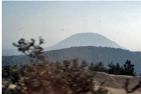
2016 Mount Tabor from Nazareth