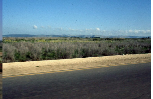
1970 Flat fields of Jezreel Valley