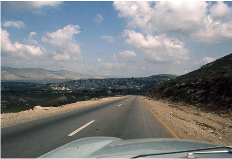
1970 Village of Cana ahead