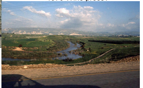
1970 Jordan River south of Lake

The following views are of Jerusalem in both years, starting with the view in 1970 from the side of the Mount of Olives, then in 2016.