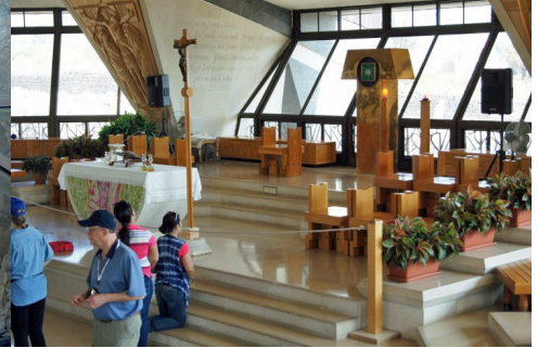
2016 Worship center

The other large structure at Capernaum is the white synagogue built on the dark foundation of the original building of the time of Jesus.