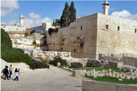
2016 finished restoration at same corner