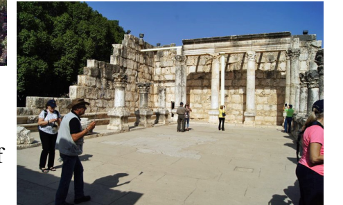
2016 Restored walls

For the photo of Gail in the synagogue I had to climb to the top of a pile of stone rubble. The fallen stones have restored to walls so that view is no longer possible.