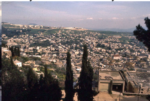
1970 Nazareth well in center right