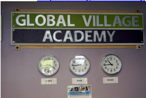
Times in China, Spain, Russia.