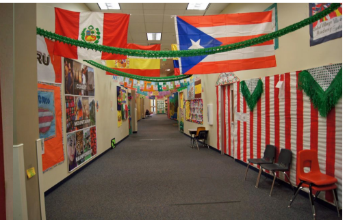
Spanish Village hallway