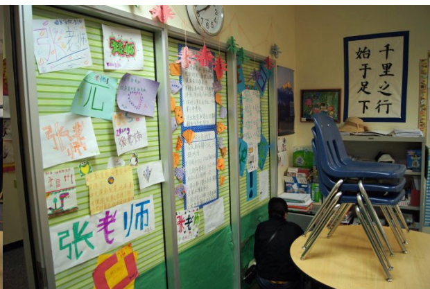
Another wall of her classroom

It appears that there is an increasing need for teaching Mandarin language in American schools.