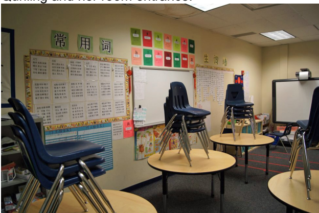
The Chinese side of Qunling's classroom.