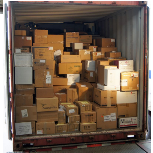
All ready to go to Congo

Normally we try to tightly pack the container so that there is no room for anything to move. That limits damage during shipment. This shipment to Congo has some empty space.