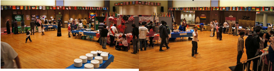
The right photo is of the Chinese tables.

Late Saturday afternoon we went to the annual International Day activities of Colorado School of Mines, Golden, Colorado. There are 750 students from other countries there. Many of them provided sample foods representative of their countries. In the evening many of them presented talent and fashion shows for the audience. The first two photos show some food booths before crowds came.