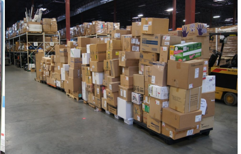
The remainder of Boteka boxes