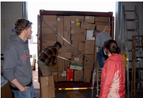
Example of fully loaded container

In the first half of December I will be visiting Lubumbashi, the capital of the province of Katanga, at the southeastern extremity of the Democratic Republic of Congo.