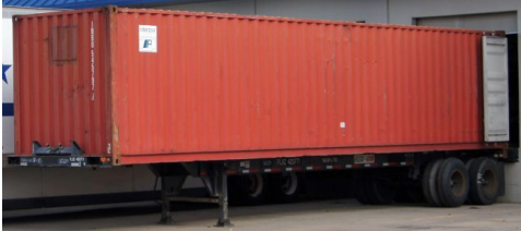
The container we loaded for Congo

For more than a decade I have been a volunteer for Project C.U.R.E. ( www.projectcure.org ) which collects donated medical supplies and equipment and sends them to more than 130 needy countries. Normally I keep the boxes of medical supplies in order in the main warehouse in Centennial, Colorado, a suburb of Denver, working there on Thursdays. On Friday, 6 November, I helped load a container destined for the province of Equator in northwestern Democratic Republic of Congo. The shipment is sponsored by the Congo agricultural company Feronia ( http://www.feronia.com/ ) which operates palm oil plantations for domestic consumption. Part of the shipment will go to their hospital at Yaligimba (N 2 deg 13' 29", E 22 deg 55' 51") which is north of the Congo River and 60 km east of the city of Bumba. The other part will go to their hospital at Boteka (S 0 deg 23' 41", E 19 deg 5' 40") which is 110 km east southeast of the city of Mbandaka. Feronia wants to provide good care for their employees and the communities that support their business.