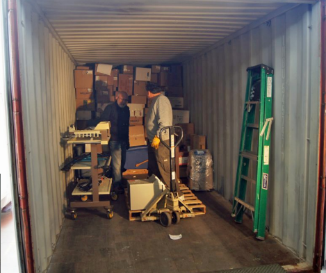
After loading the Yaligimba items