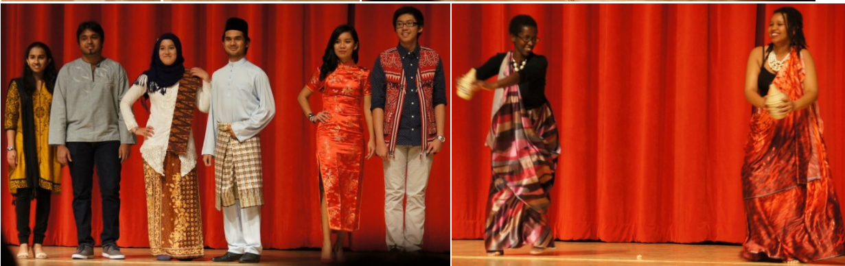
Other student's countries were represented but not included in my photos.