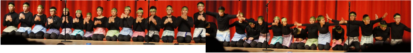
Indonesian students presented an excellently choreographed demonstration.