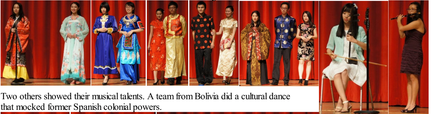
Two others showed their musical talents. A team from Bolivia did a cultural dance that mocked former Spanish colonial powers.