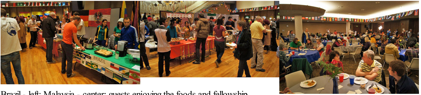
Brazil - left; Malaysia - center; guests enjoying the foods and fellowship.