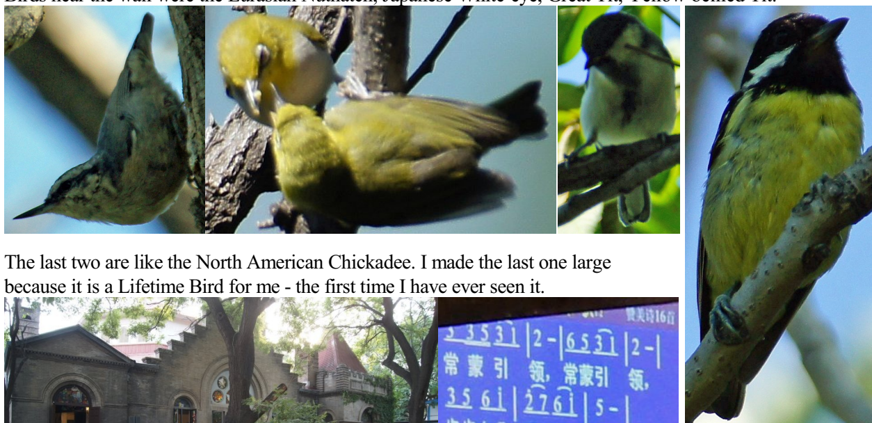
The last two are like the North American Chickadee. I made the last one large because it is a Lifetime Bird for me - the first time I have ever seen it.