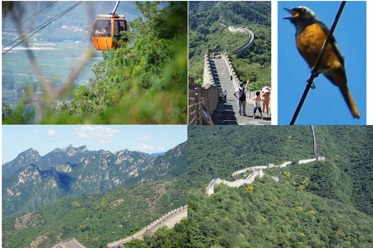
The bird above is a Daurian Redstart, which was singing in the village at the base of the cable car system. Birds near the wall were the Eurasian Nuthatch, Japanese White-eye, Great Tit, Yellow-bellied Tit.